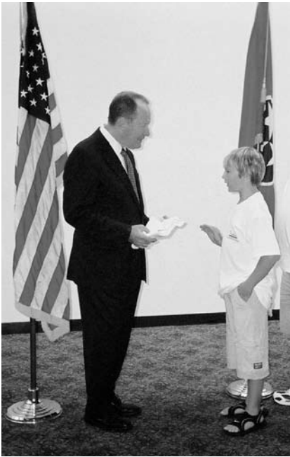
U.S. Senator Lemar Alexander