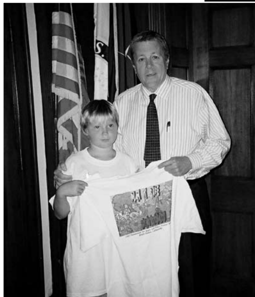
U.S. Representative John Tanner