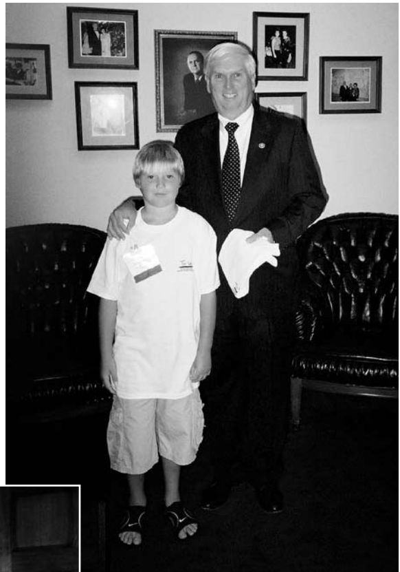
U.S. Representative John Duncan